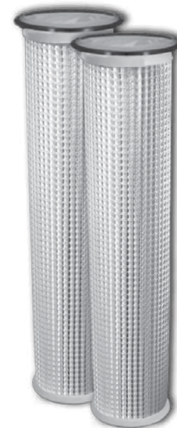
Pleated Filter Bags